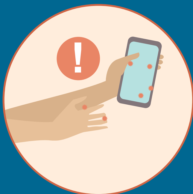
CONTAMINATED OBJECTS AND SURFACES