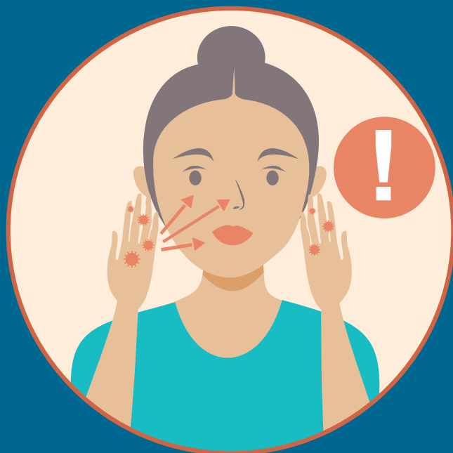
TOUCHING EYES, NOSE OR MOUTH