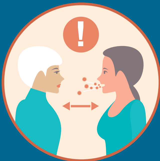
COUGH / EXHALE